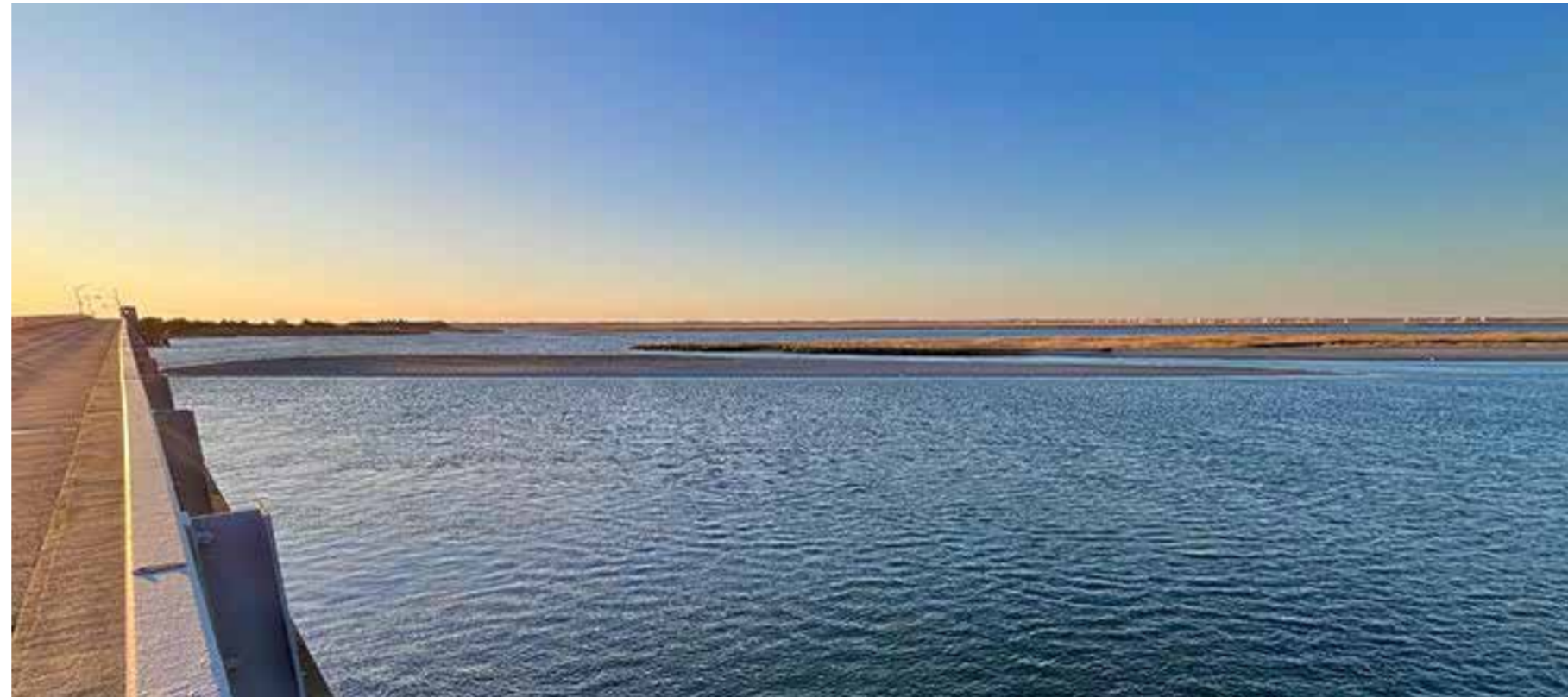
View south, you can tell summer is coming by where the sun goes down.

Each month we bring you a recent photo of interest from around Stone Harbor.